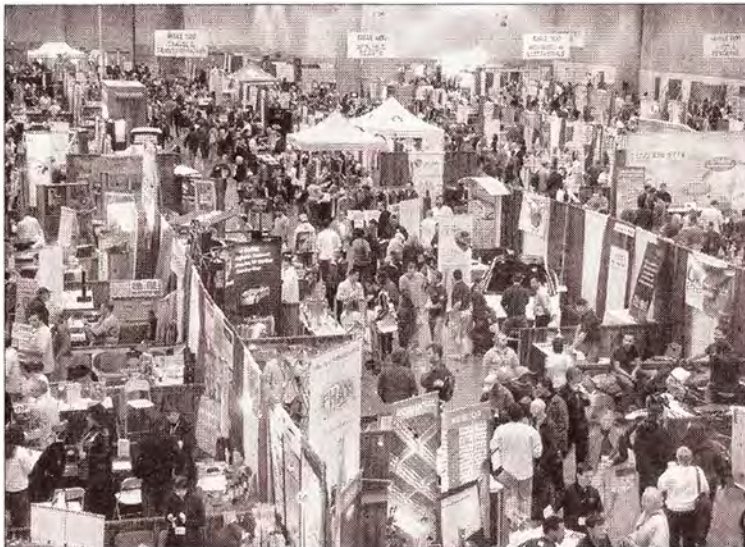
GO GREEN: The recent Go Green Expo in Los Angeles was a success.

Enter discount code: GGENYC for your 60 percent discount.